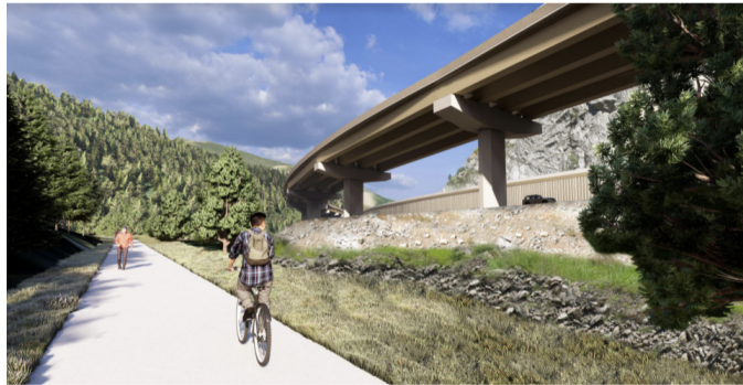
Example: Bridge A U Girders

Kevin Shanks, THK, reintroduced the issue of girder types to the TT. The TT had previously been briefed on the opportunity to refine the design of several Central Section bridge girders at the 10/6 meeting. For the bridges circled in orange on the Bridge Key Map below, the TT is considering updating the design from U girders to Colorado Bulb Tee girders. The bridges in question are Bridge A, Bridge X, and parts of Bridge M. The distance from ground level to the girders is 60-70' (Bridges A and M). The following renderings were shared, highlighting the aesthetic differences of the girder types. The TT noted the primary difference is the number of horizontal lines on the underside of the bridge, with the U girders creating less lines and the Bulb Tees creating more.