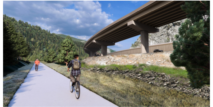
Example: Bridge A CBTs (Colorado Bulb Tees)