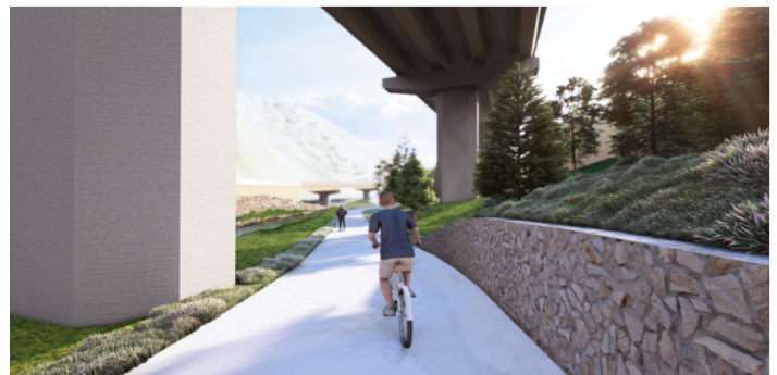
Example: Bridge M U Girders