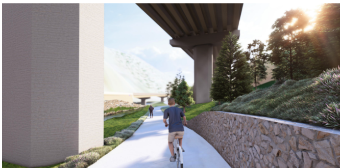
Example: Bridge M CBTs (Colorado Bulb Tees)