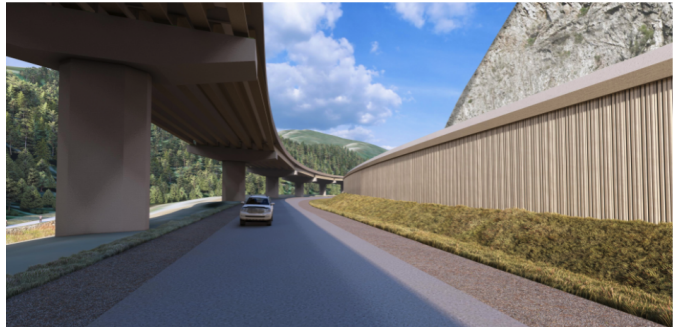
Example: Bridge A CBTs (Colorado Bulb Tees)