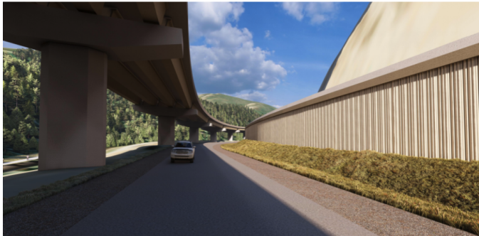
Example: Bridge A U Girders